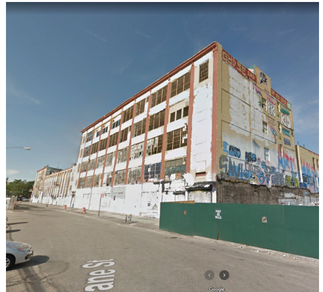
The whitewashing was uneven. Some pieces were covered completely, while others remained visible.

The specific question was a new one for the court. It had never considered “whether the work of an exterior aerosol artist—given its general ephemeral nature—is worthy of any protection under the law.” 129 Though the Carter test gave a guideline, VARA itself had no definition of “recognized stature.” At the hearing, the plaintiffs had argued for a “more expansive” 130 definition, while the defendants advocated a more “academic” 131 understanding. The choice between these different approaches would be best resolved with a trial and a jury, not a short hearing. Noting that all of the works had already been destroyed—“and the Court wished it had the power to preserve them” 132 —the court suggested that monetary damages could