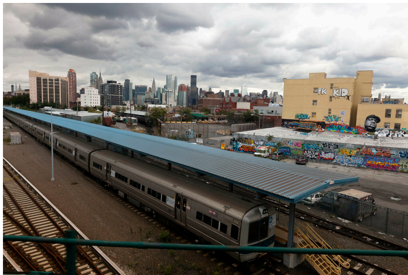
A view of 5Pointz from the nearby train yard. Spaces visible from the 7 train were some of the most desirable.

Permanence, therefore, was flexible. The longest-running, most coveted walls were those visible from the nearby 7 train. They were seen by the "millions of commuters," 199 that passed by on the elevated tracks, a powerful reminder of the origins of the art form.