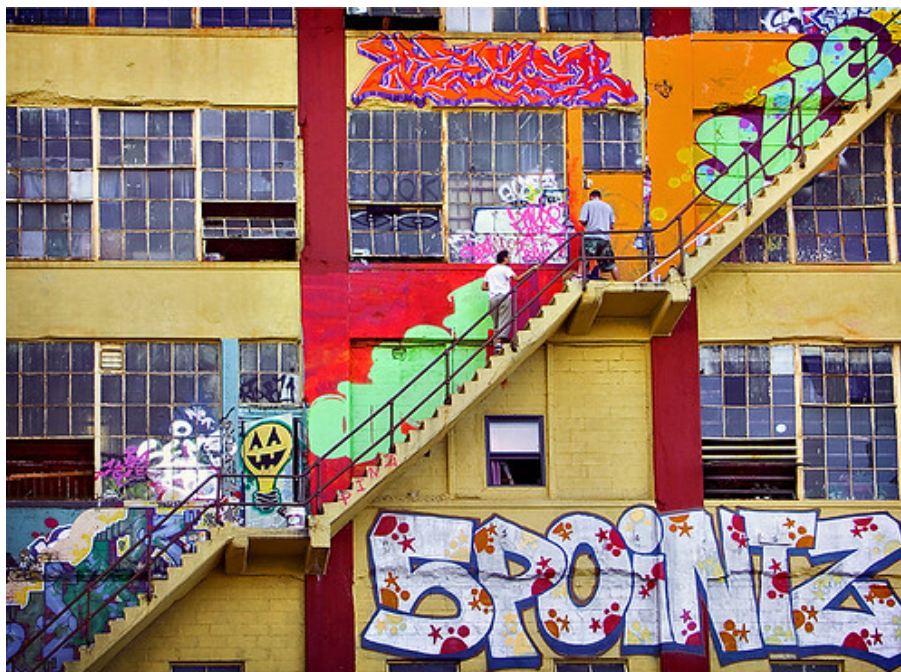
The exterior staircase at 5Pointz.