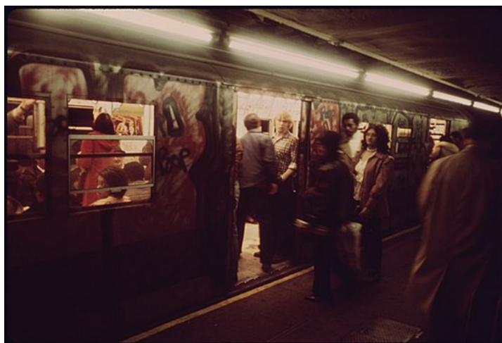
Passengers boarding the subway in New York City, 1974.

an estimated $10 million on anti-graffiti efforts that year. 16 It was not enough. In 1973, it reported that 63 percent of all subway cars remained “heavily defaced” 17 with graffiti, and 75 percent of that graffiti happened in the city’s subway yards. 18