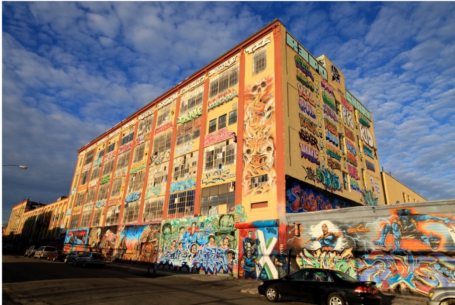
The artwork at 5Pointz included writers’ tags as well as larger productions.