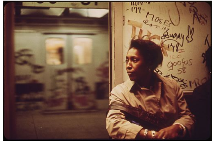
Graffiti on the interior and exterior of subway cars in New York City, 1973.