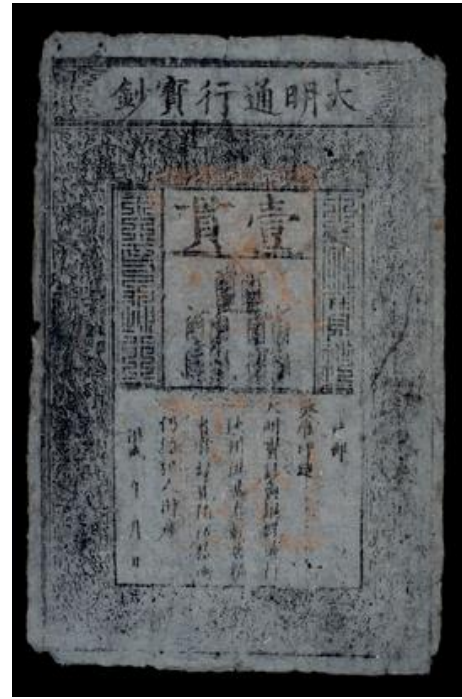
First paper money, China, circa 1020 AD