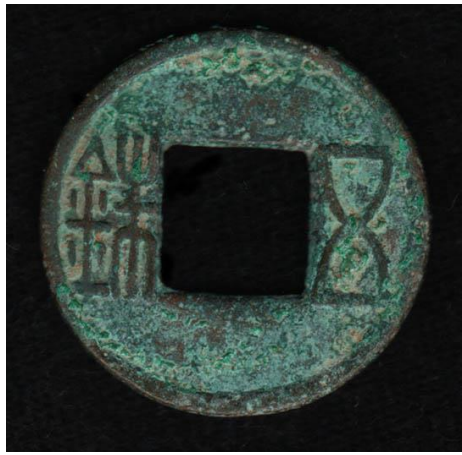
First coins, China, circa 770 BC