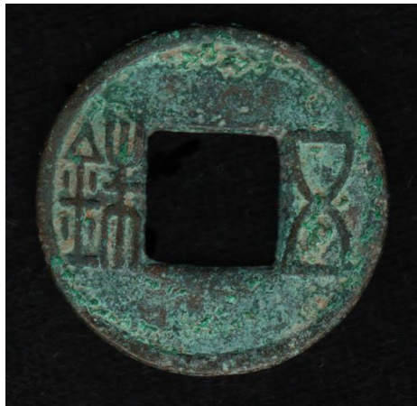
First coins, China, circa 770 BC

“With these pieces of paper, made as I have described, he [Khubilai Khan] causes all payments on his own account to be made; and he makes them to pass current universally over all his kingdoms and provinces and territories, and whithersoever his power and sovereignty extends. And nobody, however important he may think himself, dares to refuse them on pain of death. And indeed everybody takes them readily, for wheresoever a person may go throughout the Great Kaan’s dominions he shall find these pieces of paper current, and shall be able to transact all sales and purchases of goods by means of them just as well as if they were coins of pure gold. And all the while they are so light that ten bezants’ worth does not weigh one golden bezant. ” Marco Polo, circa 1275